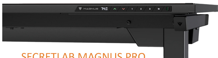
SECRETLAB MAGNUS PRO

The Magnus Pro Standing Desk is the ultimate workspace transformer that will keep all those unsightly cables organised. Say goodbye to the mundane sitting life and embrace the power of standing tall.